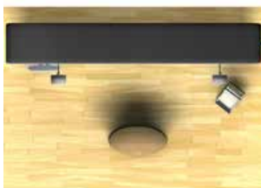
Aerial grid of 10' x 10' space