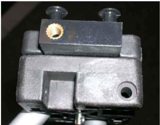
C/E pins have a brass insert.