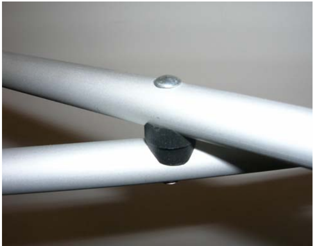
C/E crossbars are riveted together.