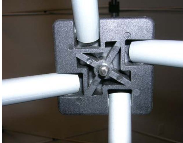
B/D hubs have crossbars screwed into hub.