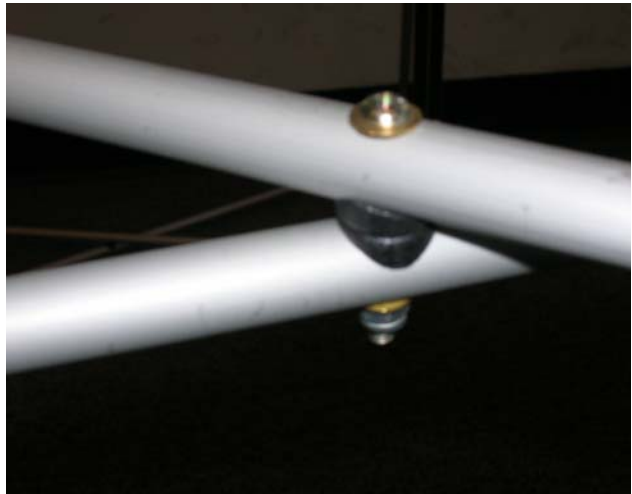
B/D crossbars are nut and bolted together.