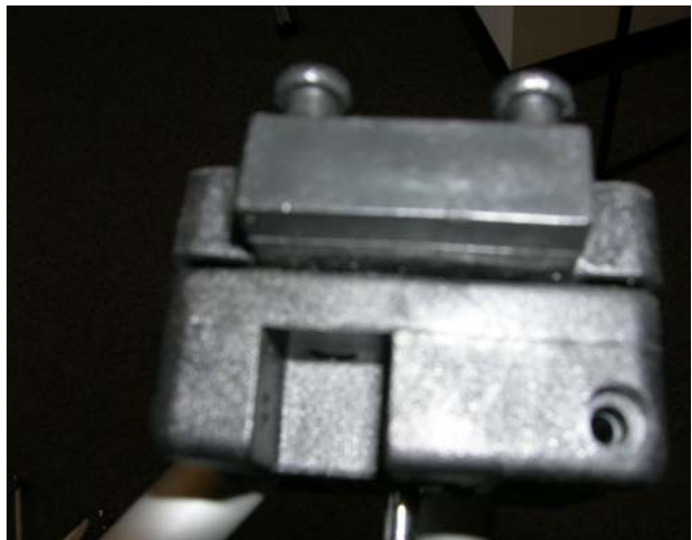
B/D pins have no insert.