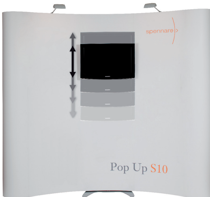
The floor stand allows you to determine the height of the screen. Maximum height 180 cm.