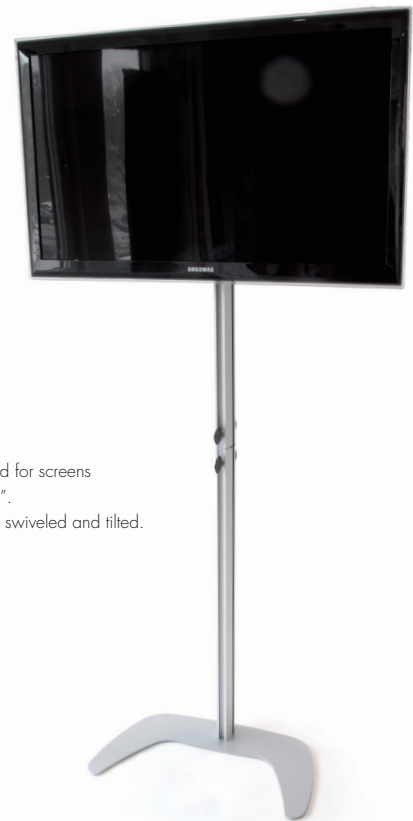
Graceful floor stand for screens up to 30 kg or 42". The screen can be swiveled and tilted.

THE MONITOR STAND S10 fits perfectly as an integrated flat screen holder for your Pop Up S10. Or simply use it as traditional flat screen floor stand, all depending on the situation and what you prefer. Adjustable height up to 180 cm. The pole is divisible for optimized handling, transportation and storage.