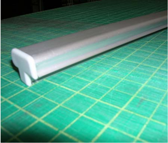
Step 1. Remove plastic from bar