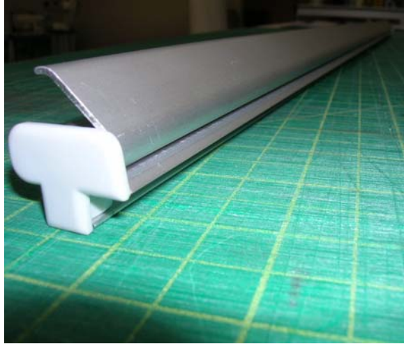
Step 2. Pry open bar