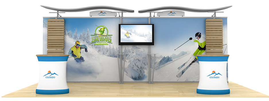
*Monitor not included